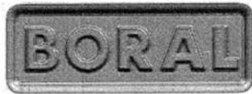
LABEL FOR BORAL VILLA 900 CONCRETE TILE (LOCATED ON THE UNDERSIDE OF TILE)