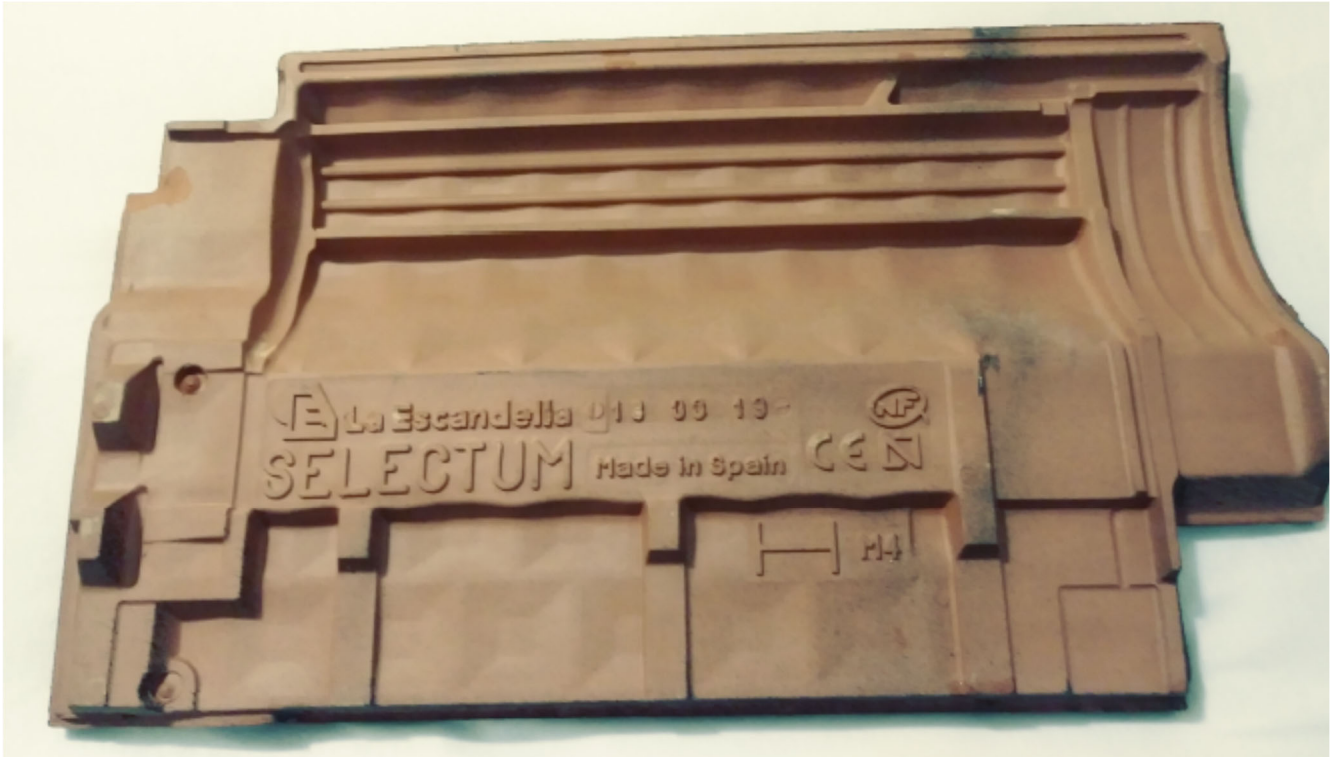
LABEL FOR LA ESCANDELLA S CLAY ROOF TILE (LOCATED ON THE UNDERSIDE OF TILE)

All tiles shall bear the imprint or identifiable marking of the manufacturer's name or logo as detailed below, or following statement: "Miami-Dade County Product Control Approved".