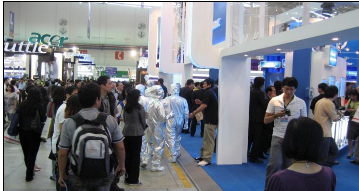
Pictures above show the official opening ceremony of the 2009 Computex Taipei Exhibition Show at the Nangang Exhibition Hall.