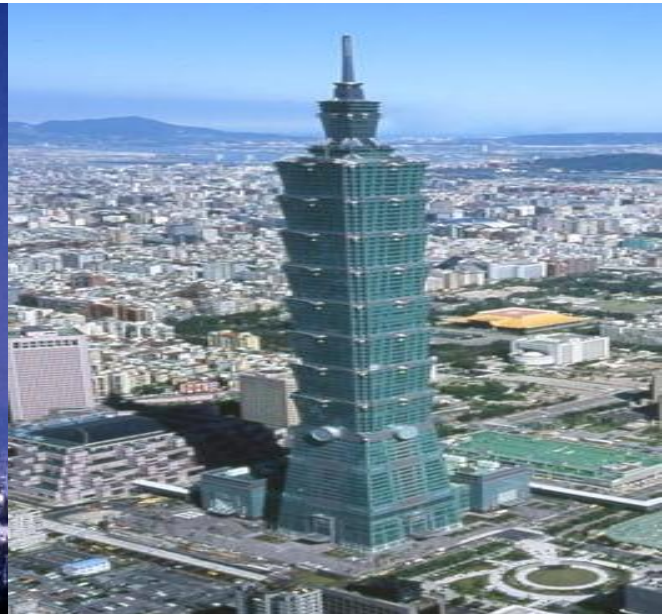
Taipei 101 Building, World's Tallest Building Since 2004