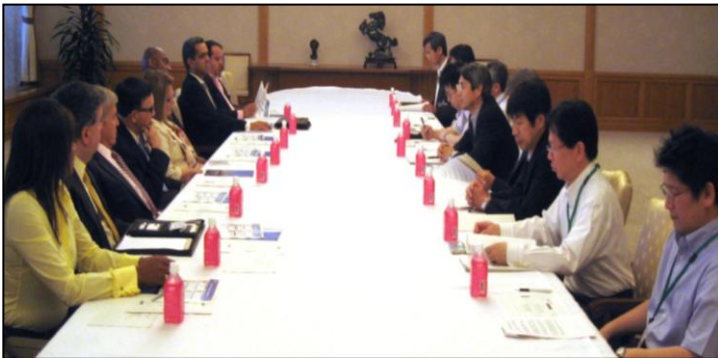
Pictures show Miami-Dade County delegation with the Vice Mayor of Osaka and Osaka city officials

Osaka with a population of 2.6 million inhabitants is the 3 rd most populous city in Japan (after Tokyo and Yokohama). Osaka is the capital of Osaka Prefecture on the southern coast of western Honshu, Kansai and is an industrial city and a great feudal capital. Osaka and the Kansai region comprise a vibrant and robust economy, including; steel manufacturing, transportation equipment, metal products, appliances, pharmaceuticals, apparel, finance, and telecommunications. Osaka is one of Japan's leading ports and manufacturing centers. The city has many rivers and canals with a sheltered harbor and an expansive bay, which houses the Kansai International Airport, built on a man-made island.