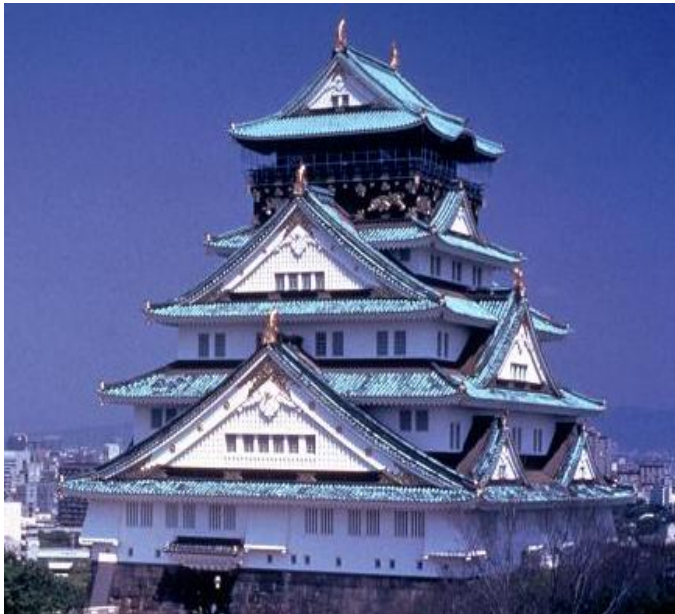
Osaka Castle, Japan