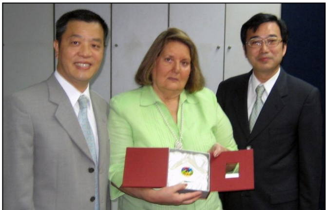
Pictures above show Miami-Dade County delegation with officials of Taipei City Government, Taipei City Hall