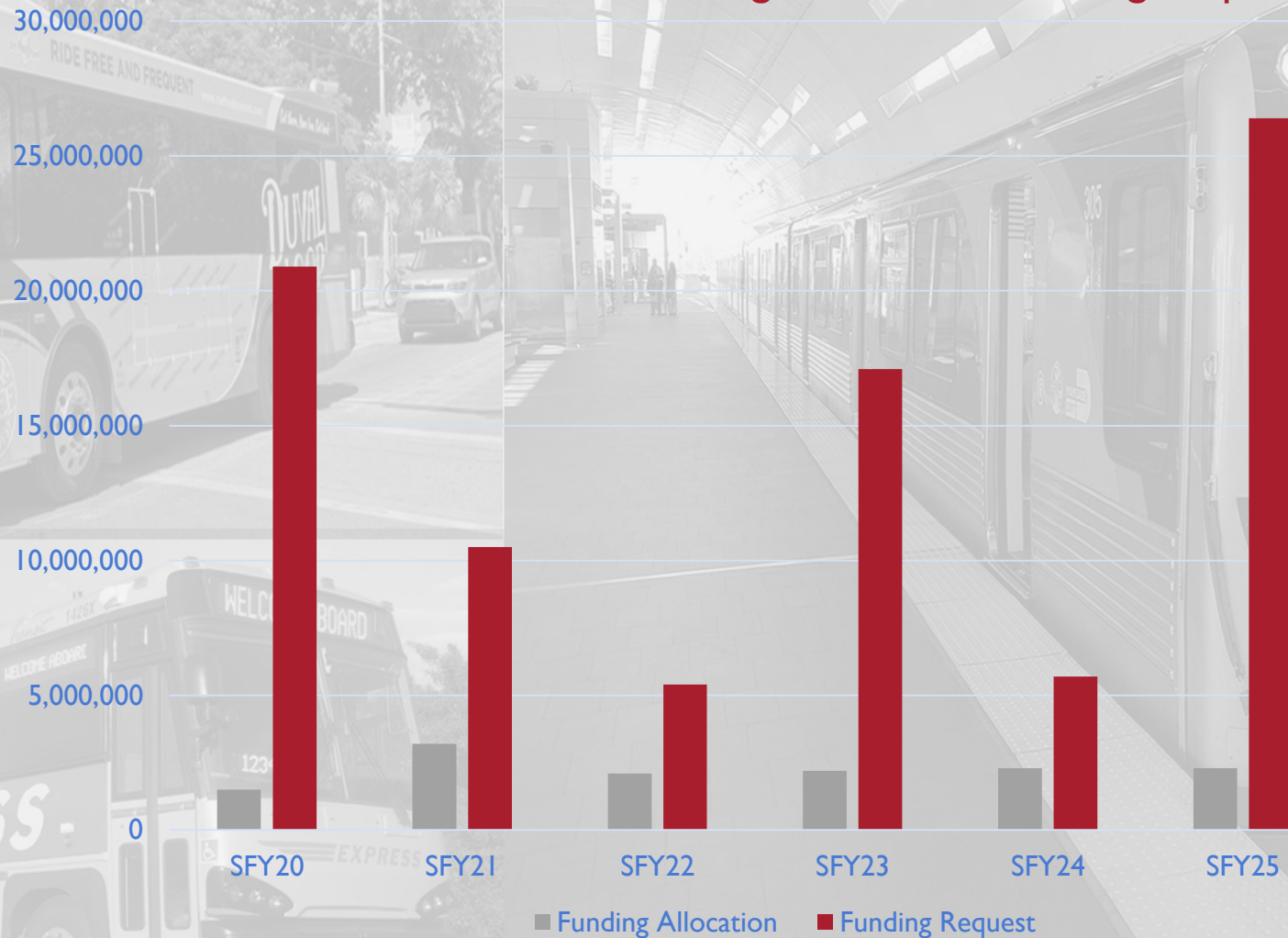
District Six – 6 Year Funding Allocation / Funding Request