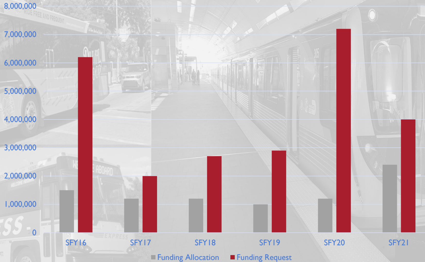
District Six – 6 Year Funding Allocations / Funding Requests