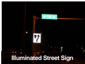
Illuminated Street Sign