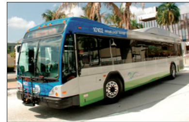
40-foot Hybrid Electric Bus

The active bus fleet as of this quarter consists of 702 40-foot buses, 25 62-foot Articulated buses, 12 45-foot over-the-road buses, and 78 30-foot minibuses for a total of 817 active buses. This is an increase of 116 buses since PTP was approved in 2002. In addition to the active fleet are 4 retired buses that form MDT's Contingency Fleet.