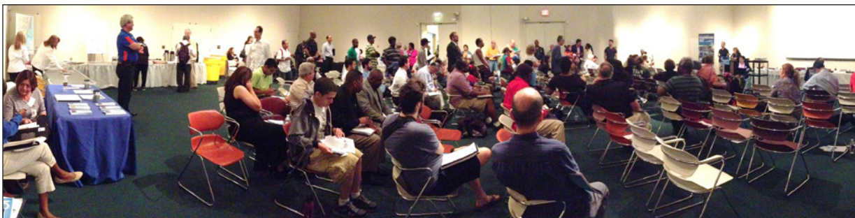
Participants at the line up to provide input during the Community Forum

The Trust hosted the Transportation Summit Community Forum: An Opportunity for Public Input on Saturday, February 22, 2014, at the Miami-Dade Main Library Auditorium. The Community Forum was a follow up event to the 2013 Transportation Summit, "Visioning the Future of Miami-Dade County's Public Transportation." The Transportation Summit Community Forum featured the Report on Proceedings, which details the outcome of the 2013 Transportation Summit and the purpose was to solicit comments from the public on the Report and the future of public transportation in Miami-Dade County. There were about 130 participants who were also able to post comments