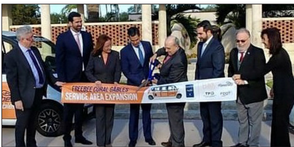
Spotlight: 1st/Last Mile Demonstration Projects

During the second quarter two surtax-supported SMART Plan demonstration projects were launched both using the Freebee electric vehicles. The Village of Pinecrest introduced the Transitway Circulator which connects to the South Dade Transitway and the Dadeland South Metrorail station. The City of Coral Gables expanded its existing Freebee service to offer a ride around downtown Coral Gables with a connection to the County transit system at the Douglas Road Metrorail station.