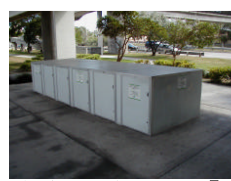
☐ Imagen de recinto encerrado