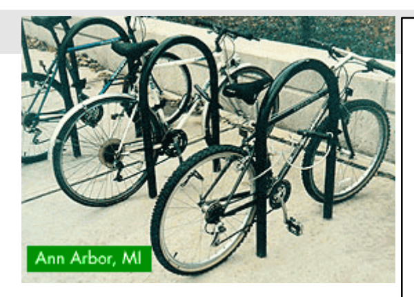
Cycle-Safe: Inverted U Rack