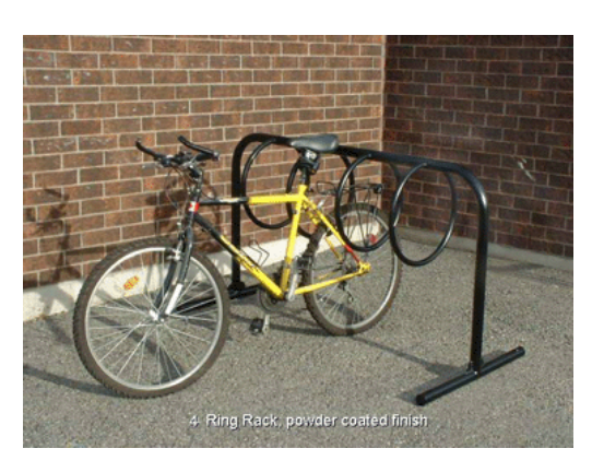
Bike-Up: Ring Rack Bicycle Rack

Name: Ring Rack Company: Bike-Up Phone: 800-661-3506 Website: www.bikeup.com