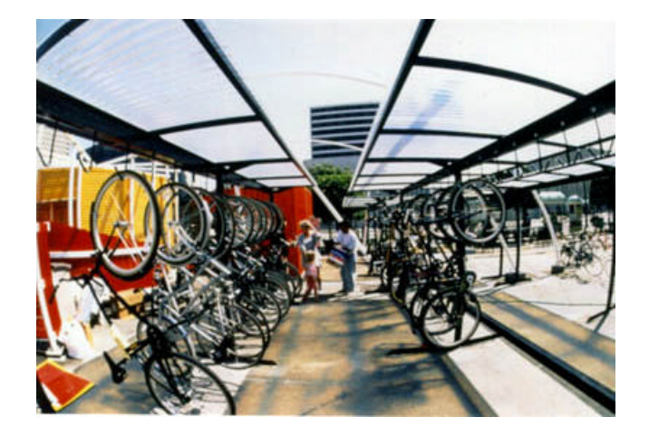
☐ Imagen de recinto descubierto