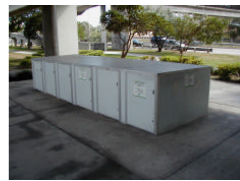
☐ Bike locker