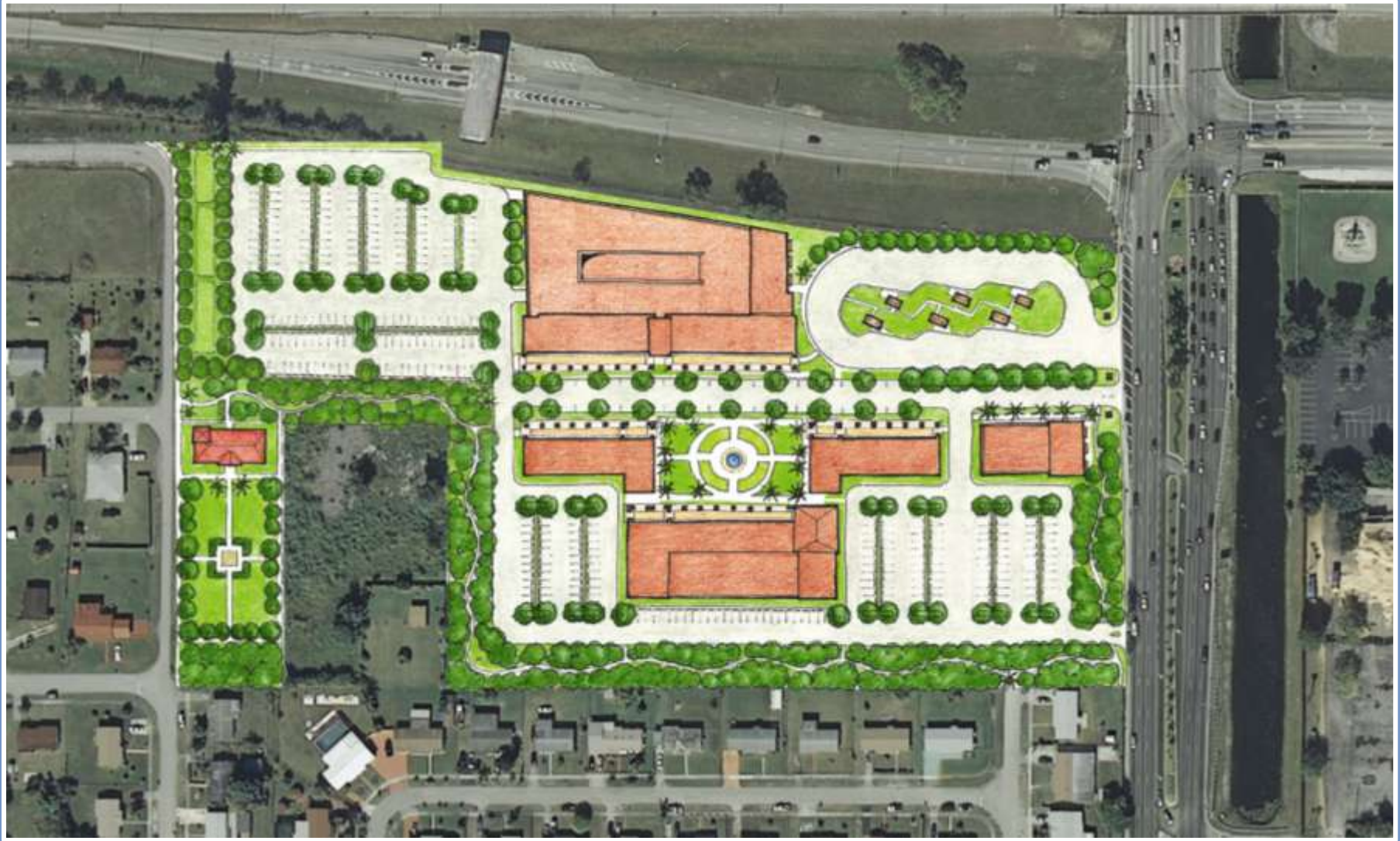
Conceptual Master Plan with parking garage situated along the Homestead Extension of the Florida Turnpike