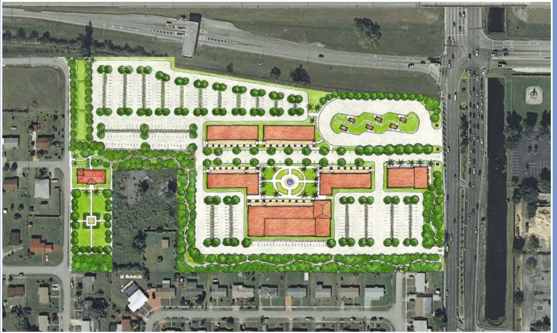
Conceptual Master Plan