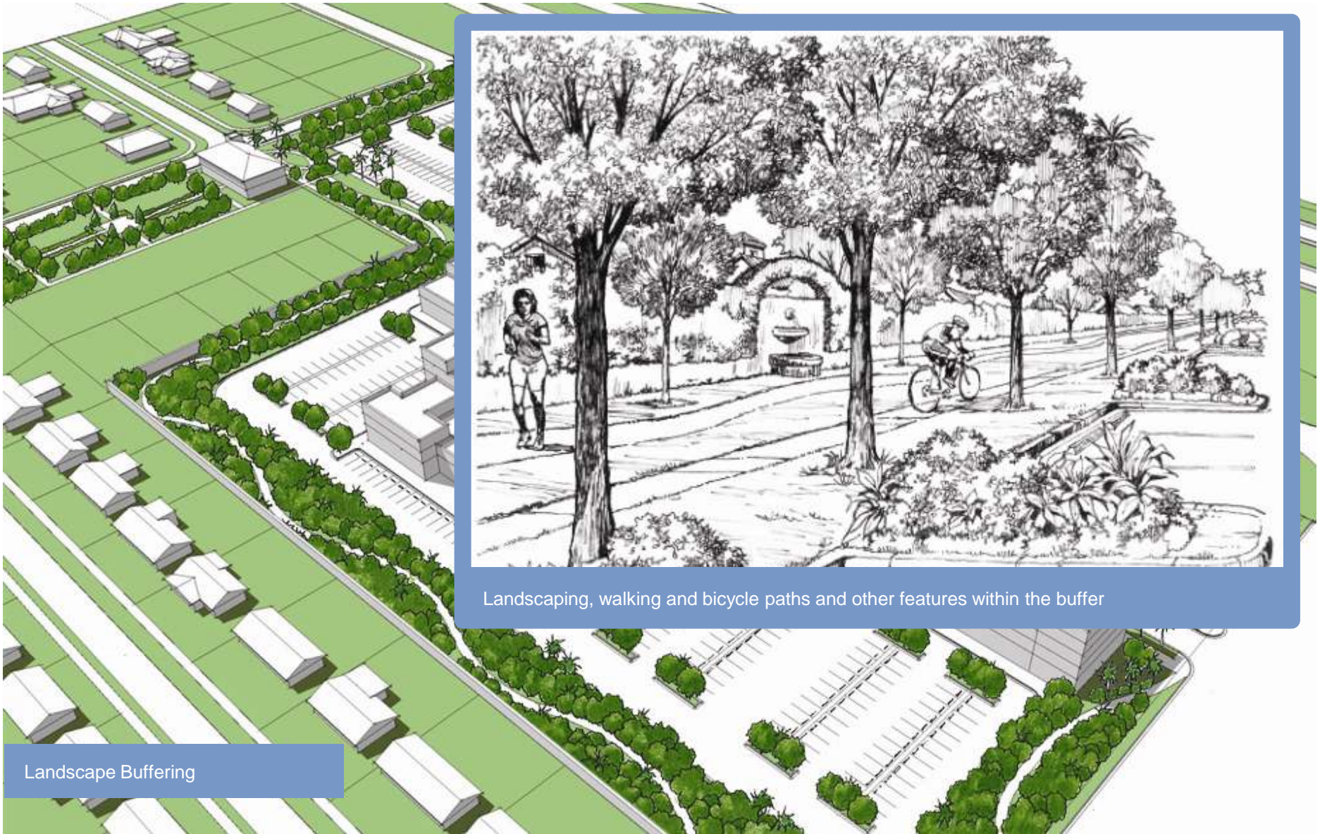
Landscaping, walking and bicycle paths and other features within the buffer