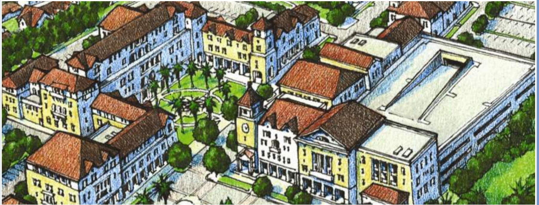
Aerial view of proposed development looking into the main plaza.

http://www.miamidade.gov/planzone/udc/215ST/NW215St-27AveReport.pdf