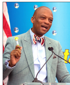
Oliver G. Gilbert Mayor of the City of Miami Gardens