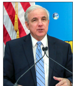
Carlos A. Gimenez Mayor of Miami-Dade County

During that same seven day period before and after the summit, 1.5 million social impressions were made surrounding the summit with each post receiving an average of 2,300 impressions.