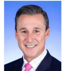
Sen. René García District 13