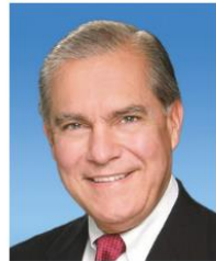
Sen. Javier D. Souto District 10