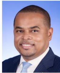
Keon Hardemon District 3