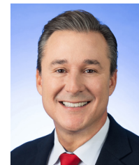
Sen. René García District 13