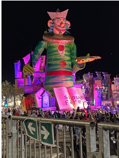
Float at the Viareggio Carnival

The Sister Cities Agreement promotes cultural exchanges between the two regions and the Sister Cities Agreement mentions the expansion of cultural exchanges and promoting cultural initiatives. Viareggio is a candidate to be the Cultural Capital of Italy in 2024.