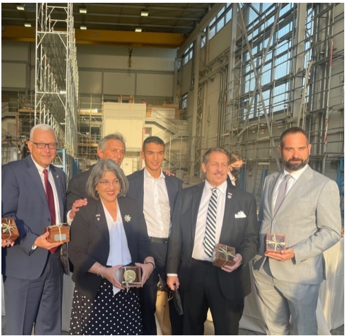
Site visit at Cantieri Viareggio