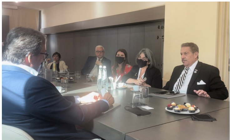
Miami-Dade County delegation during presentation at SanLorenzo