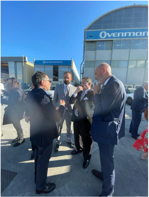
Miami-Dade County delegation site tour visit of Overmarine