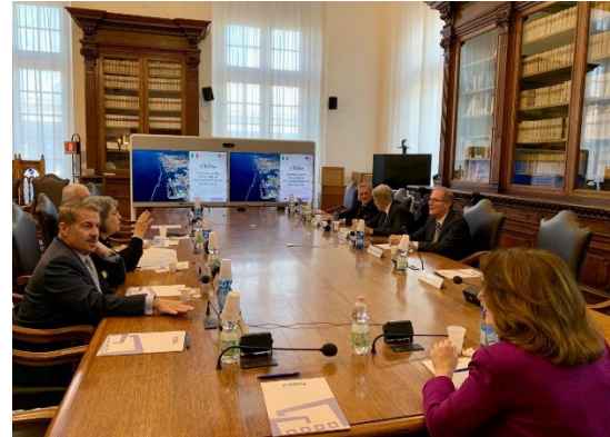
Miami-Dade County delegation meeting with the Liguria Region, City of Genoa and the Western Ligurian Sea Port Authority