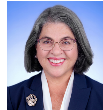
Mayor Daniella Levine Cava Miami-Dade County