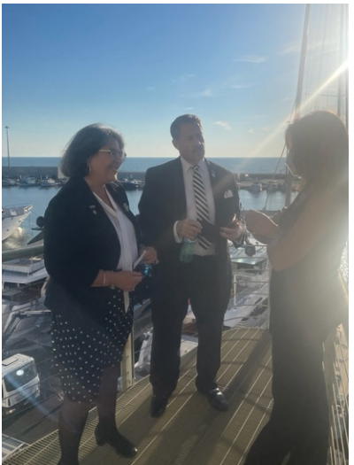
Miami-Dade County delegation meeting with Codecasa and site visit