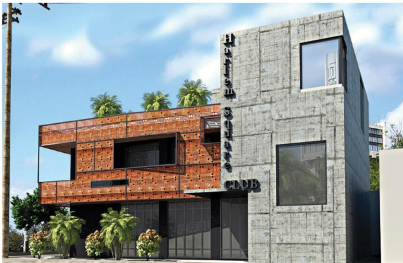
Rendering of Harlem Square

The $2 million funding will be used to purchase an eyesore that is currently used as a convenience store and incorporate it into Harlem Square, which will be a lounge, meeting place, and entertainment facility.