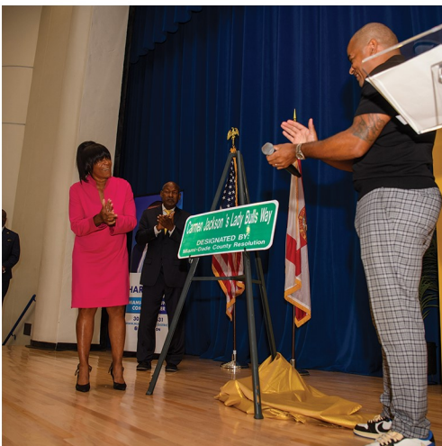
Keon Hardemon, Esq. Miami-Dade County Commissioner

A stylized handwritten signature in black ink, consisting of a large 'K' followed by a horizontal line and two vertical strokes.