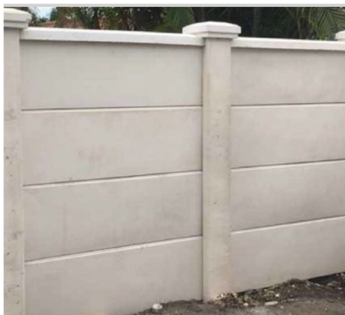
New Entryway Wall Rendering

A portion of NW 42 nd Street between NW 27 th Avenue and NW 29 th Avenue is now officially known as Dr. Enid Curtis Pinkney Street.