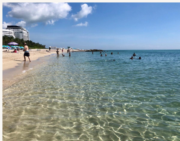
after seaweed removal