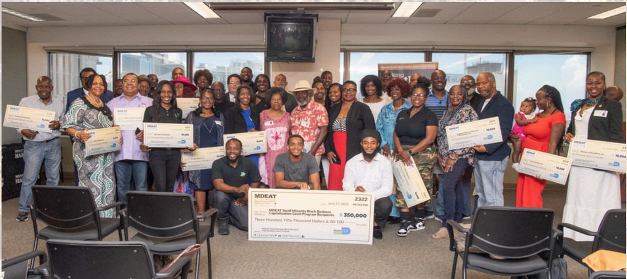
2023 SMALL BUSINESS CAPITALIZATION PROGRAM [$10K]