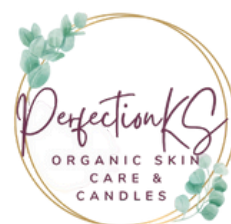
PERFECTIONKS 3RD PLACE SPONSORED WINNER - 2.5K