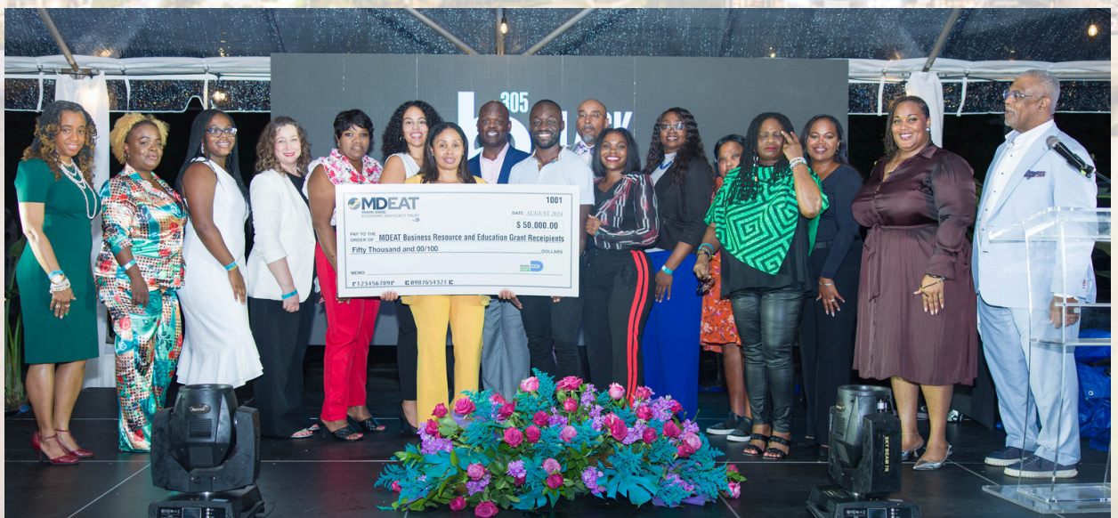
2024 BUSINESS RESOURCE AND EDUCATION GRANT [START-UP $2.5K]