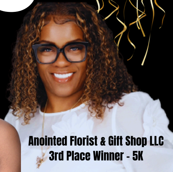
Anointed Florist & Gift Shop LLC 3rd Place Winner - 5K