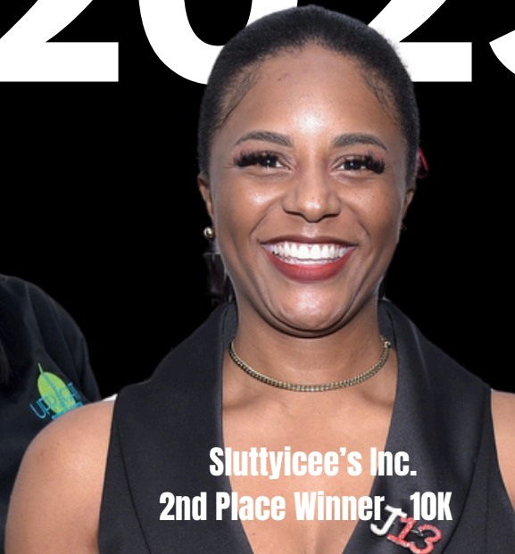
Sluttyicee's Inc. 2nd Place Winner - 10K