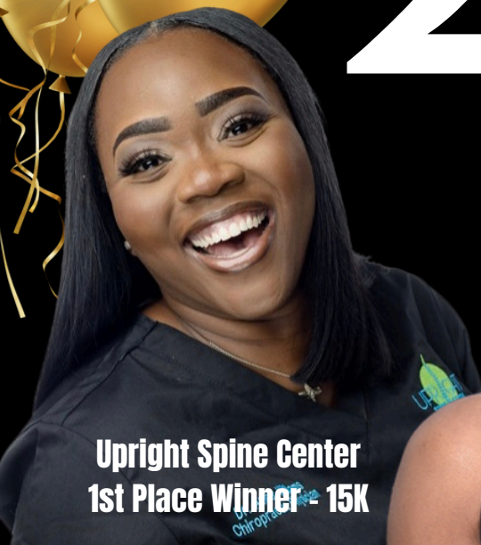
Upright Spine Center 1st Place Winner - 15K