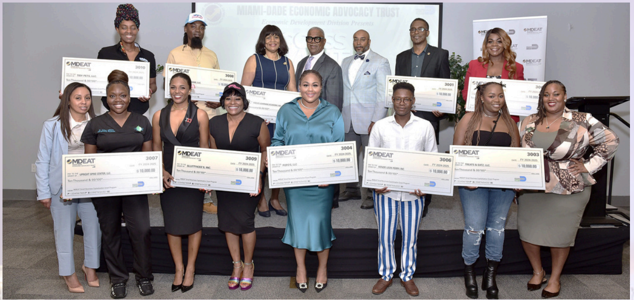
2024 SMALL BUSINESS CAPITALIZATION PROGRAM [$10K]