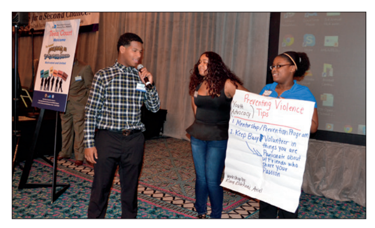
continued on page 3

The conference benefited students by exposing them to decision-making choices such as how to be good citizens, making changes in peaceful ways, and advocating for their community. Other workshops included topic on Bullying, Dating & Love Relationships, Civic Responsi-