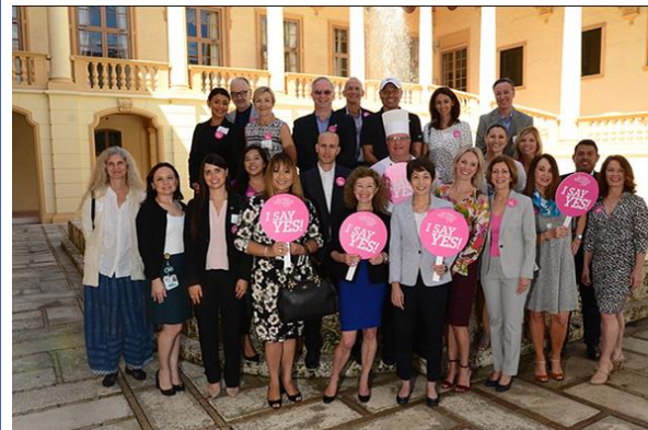
GMBHA Global Wellness Day June 2019