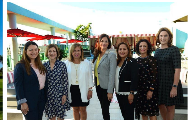
Women General Managers Panel at Atton Brickell Miami