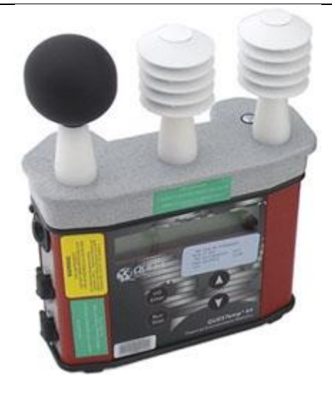
Figure 3: Waterless wet-bulb meter

A WBGT meter is the most accurate tool for adjusting the temperature for heat stress factors including humidity, air movement (i.e., wind), radiant heat, and temperature.