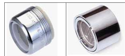
1.5 and 2.0 gpm Kitchen Faucet Aerators

Commercial dishwashers are now using less than 3 gallons per cycle. For commercial dishwashers, visit the Food Service Technology Center ( www.fishnick.com ) for water and energy efficient models.