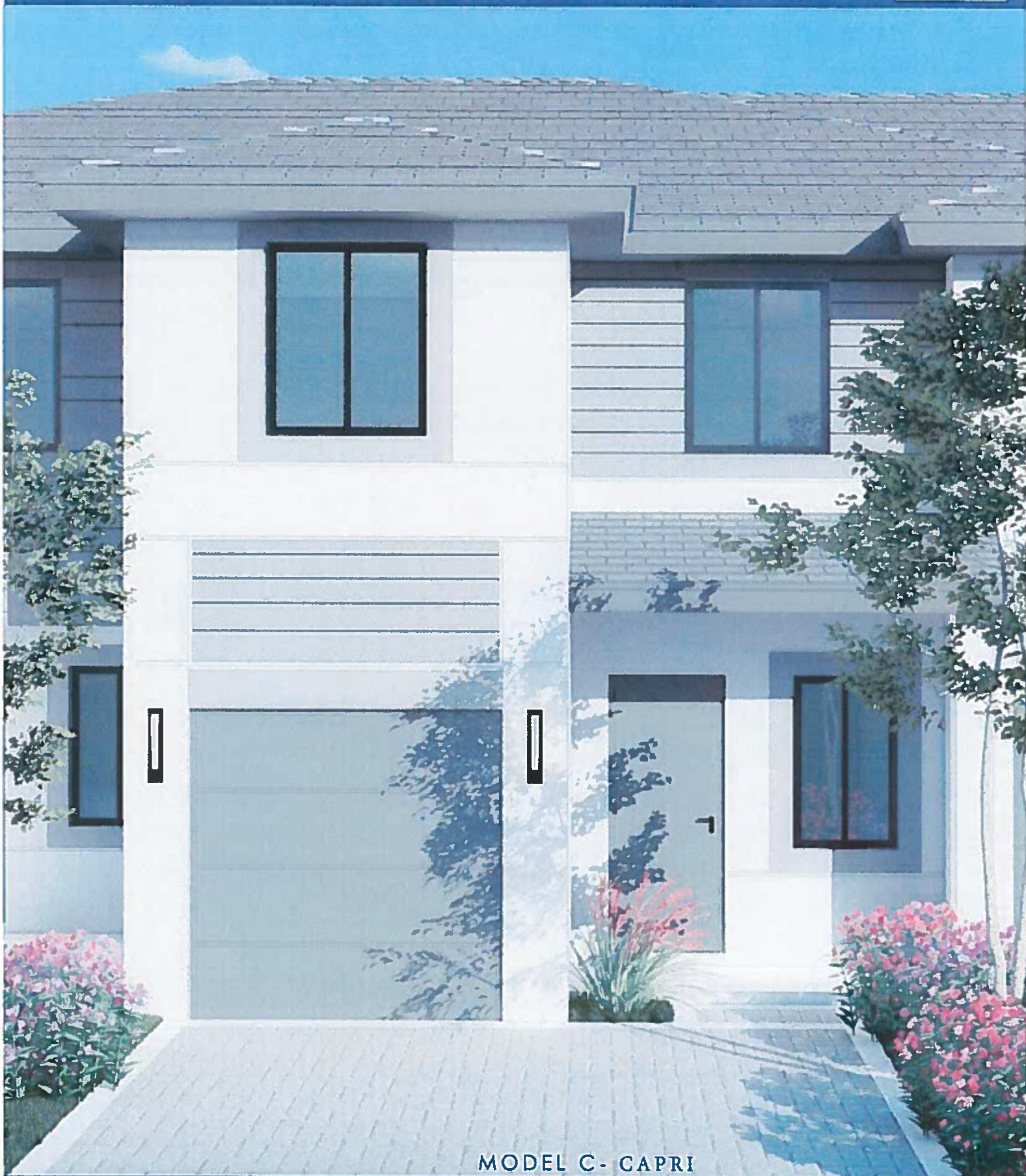
MODEL C - CAPRI

192 ND AVE. SW 344 TH Street. Florida City, Florida