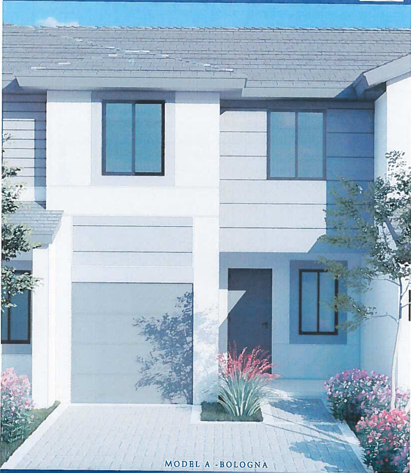
MODEL A - BOLOGNA

192 ND AVE. SW 344 TH Street. Florida City, Florida