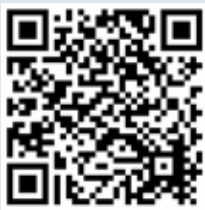
Scan for List of DPRs

(Click on DPR or Wellness Liaison for a list.)