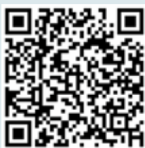
Scan for List of Wellness Liaisons

Make a personal commitment to yourself and sign-up now!