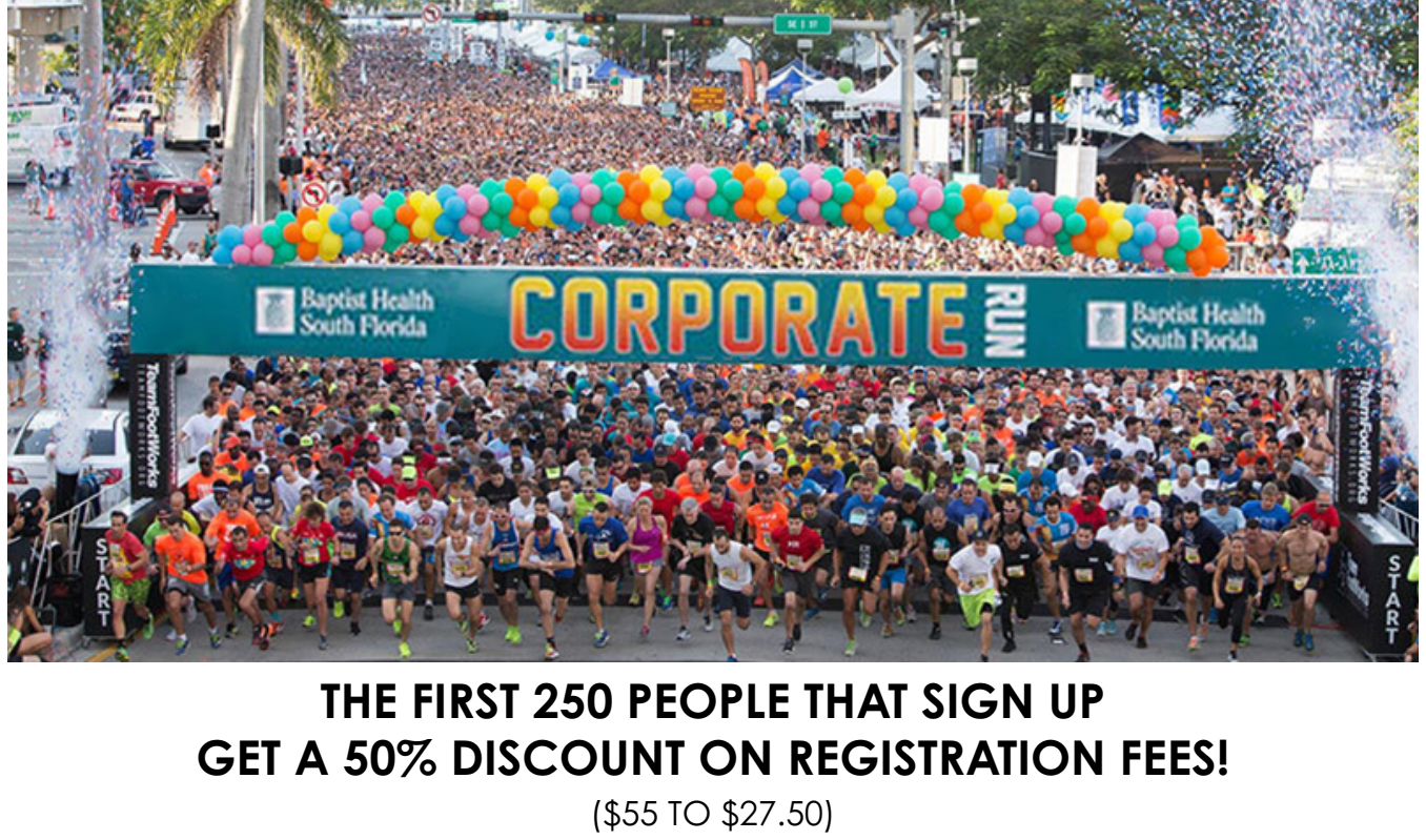
Have you never done a 5k? Below are some tips to help get you started:

• Find a pair of shoes that fit you best. At certain running stores (like Footworks), you can get a gait (walk) analysis to see what kind of shoe fits you best and will give you enough cushion and support. • Start off slow, even if your starting pace is walking. It is about not how fast you can