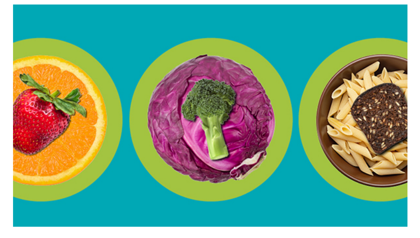
The Balanced Plate model is a simple tool designed to help you prepare your meals, including allocating your carbohydrate intake, so that you feel full and nourished until your next meal or snack.

Spring Nutrition Challenge: Fuel Your Body And Make It A Habit