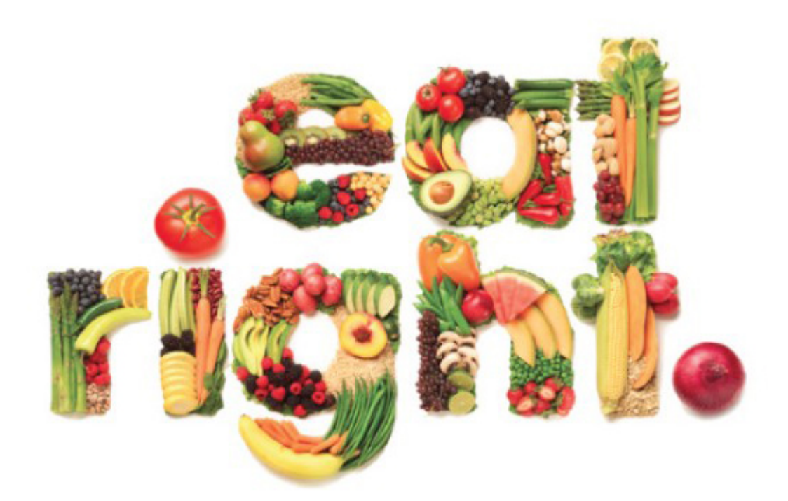
Source: <u>https://www.eatright.org/national-nutrition-</u> month#:~:text=National%20Nutrition%20Month%C2%AE%20is,eating%20and%20physical%20activity%20habits

Welcome to National Nutrition Month<sup>®</sup>, which is dedicated to shining the spotlight on the importance of making the right food choices and developing healthy eating habits through socialization.