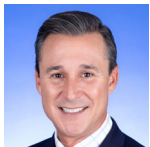
Sen. René García District 13