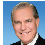
Sen. Javier D. Souto District 10