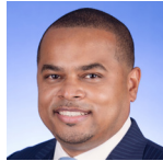
Keon Hardemon District 3