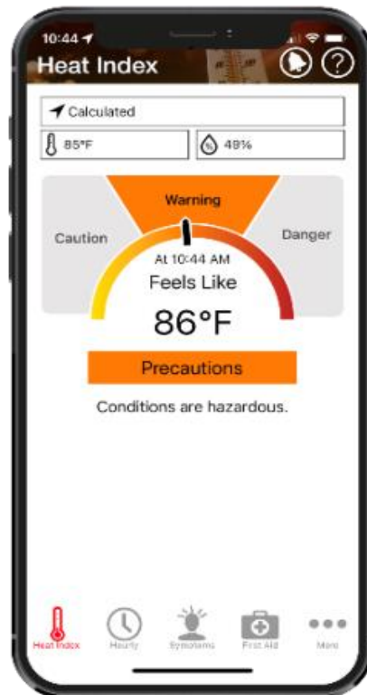
OSHA-NIOSH heat stress app