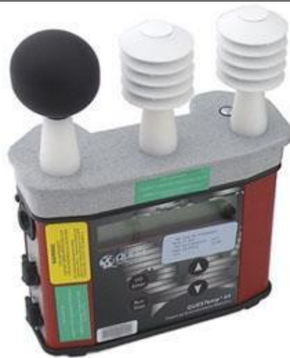
Figure 3: Waterless wet-bulb meter

A WBGT meter is the most accurate tool for adjusting the temperature for heat stress factors including humidity, air movement (i.e., wind), radiant heat, and temperature.