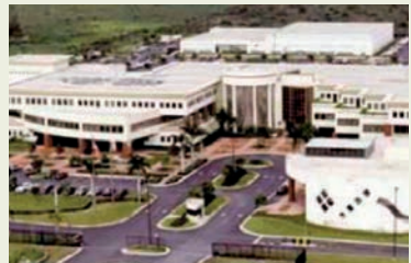
MDPD Fred Taylor Headquarters Building