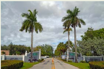
Miami-Dade Public Safety Training Institute & Research Center

Miami-Dade Public Safety Training Institute & Research Center Specialized Training Unit 9601 N.W. 58 Street, Bldg. 100 Doral, FL 33178 Attn: Sergeant Randy Caballero