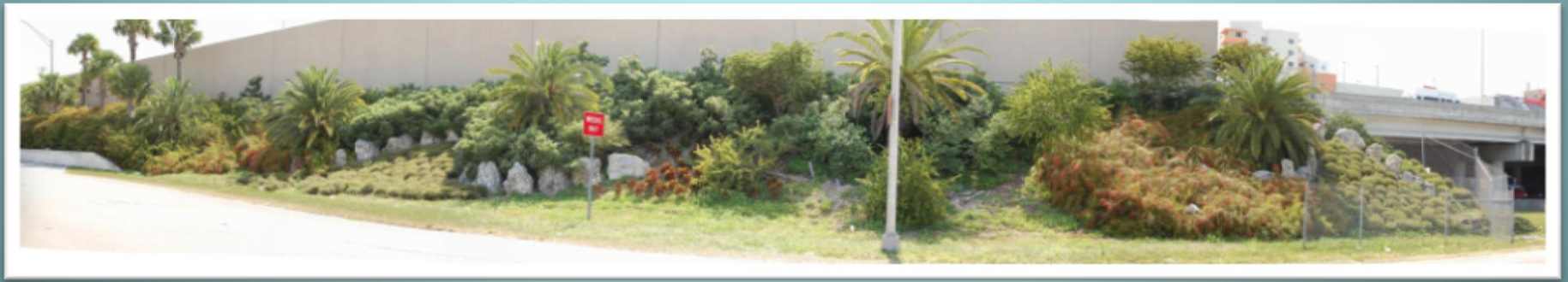
FDOT LANDSCAPE BEAUTIFICATION PROJECT SR-9A/I-95 from NW 17 th Street to NW 8 th Street (SR-836/I-395 Interchange)