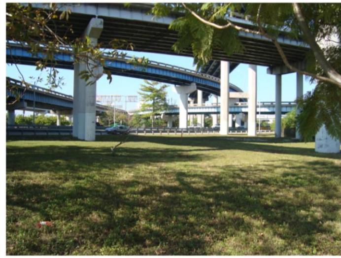
FDOT LANDSCAPE BEAUTIFICATION PROJECT SR-9A/I-95 from NW 17 th Street to NW 8 th Street (SR-836/I-395 Interchange)