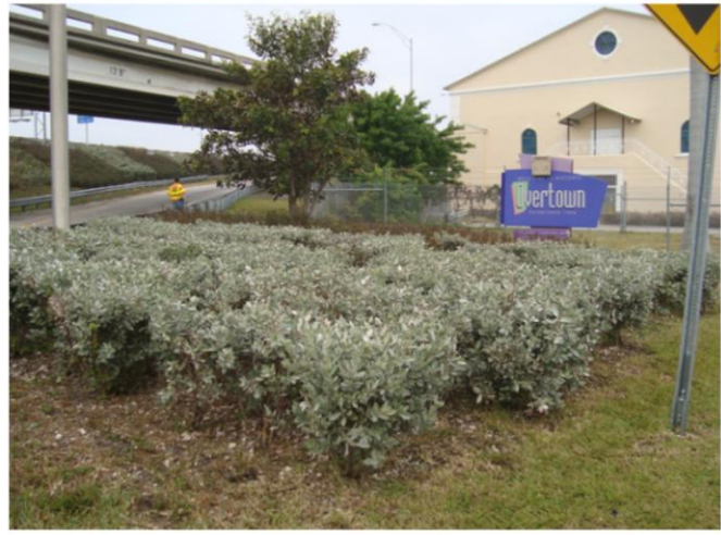
FDOT LANDSCAPE BEAUTIFICATION PROJECT SR-9A/I-95 from NW 17 th Street to NW 8 th Street (SR-836/I-395 Interchange)