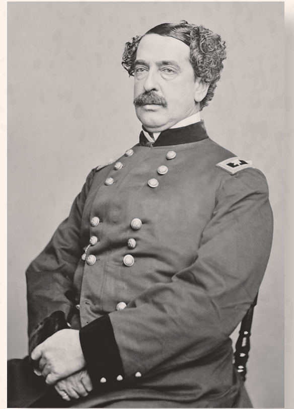
▲ Adner Doubleday, circa 1865

During the Third Seminole War (1855-1858), Captain Adner Doubleday and Captain John Brannan utilized the natural bridge to cross Arch Creek as part of the development of an expansion of military trail connecting Fort Lauderdale to the north, and Fort Dallas in Miami to the south.