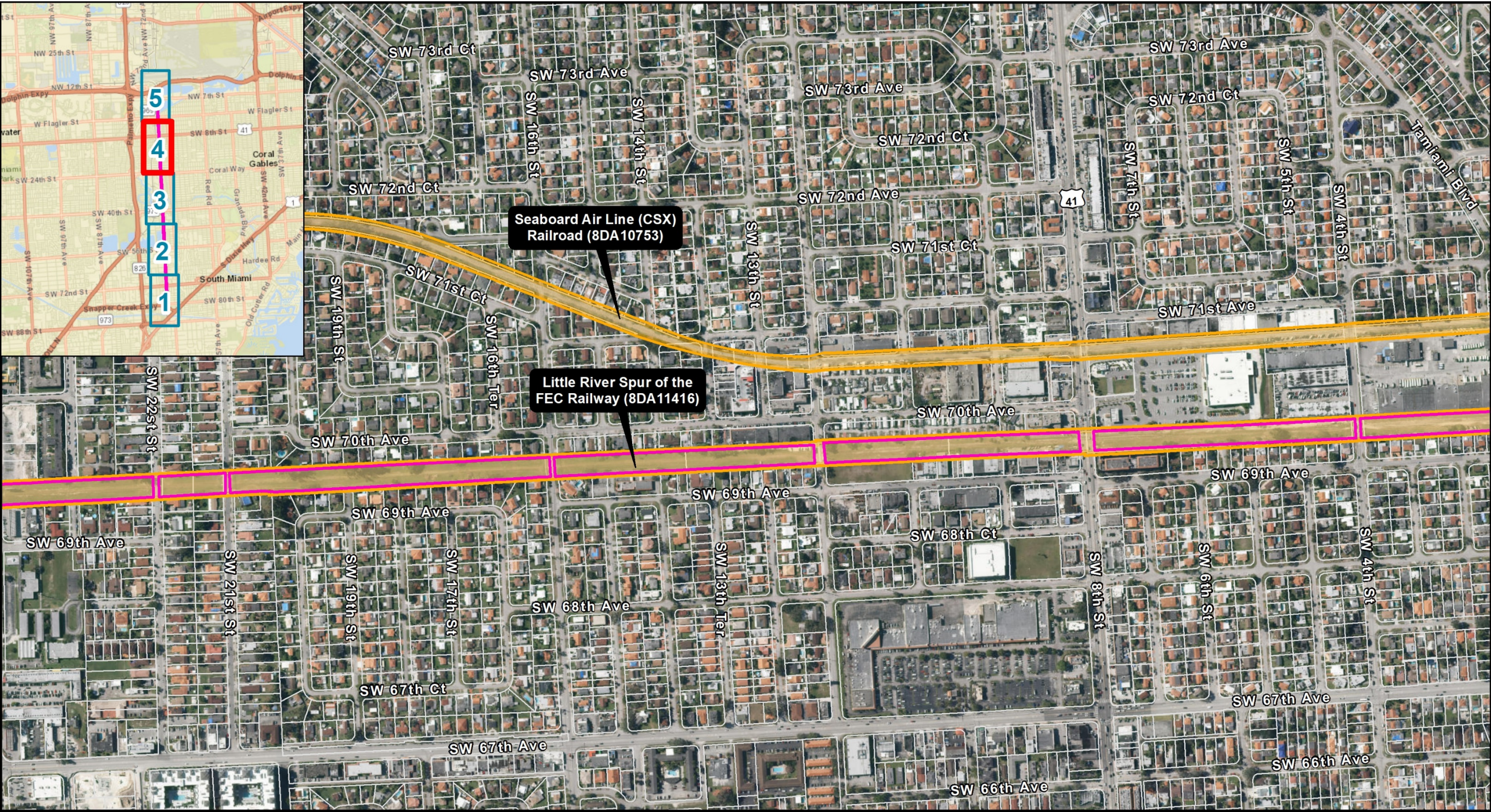
Figure 12d: Identified Historic Resources (Map 4 of 5)

Ludlam Trail Corridor Project PD&E Study (444236-1-22-01)