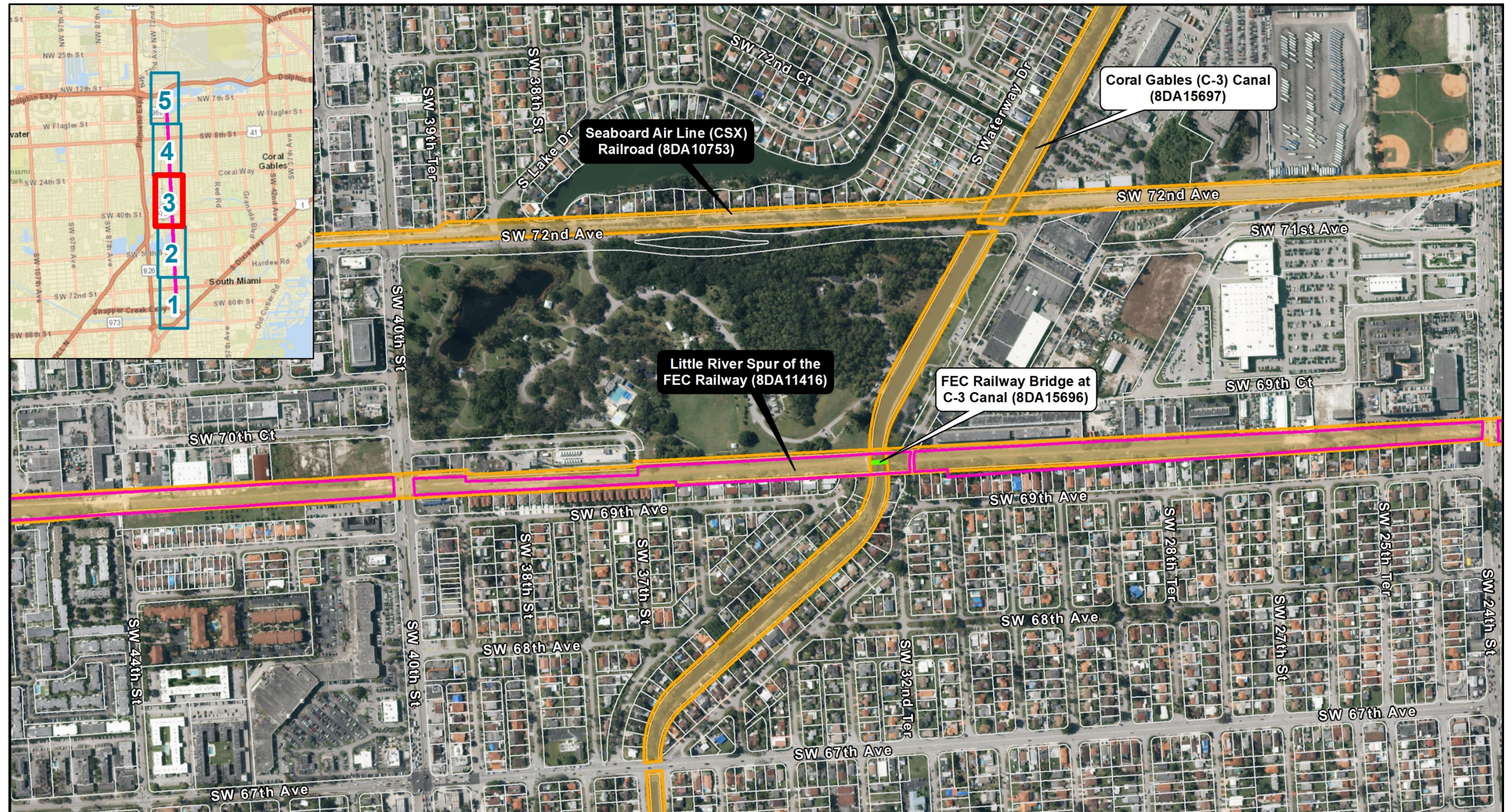
Figure 12c: Identified Historic Resources (Map 3 of 5)

Ludlam Trail Corridor Project PD&E Study (444236-1-22-01)