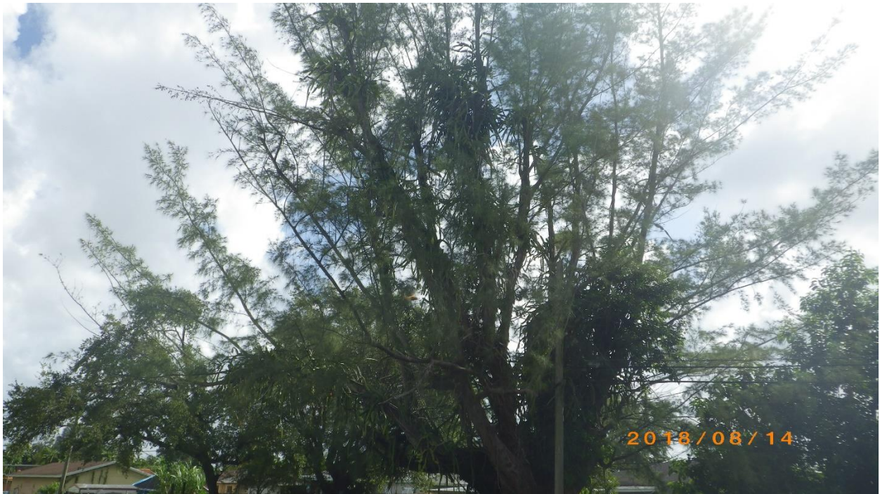
Photo 06: View northeast of Casuarina with epiphytic cactus all over it.