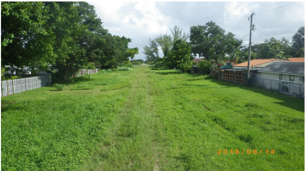
View 08: View north at SW 19 th Street.