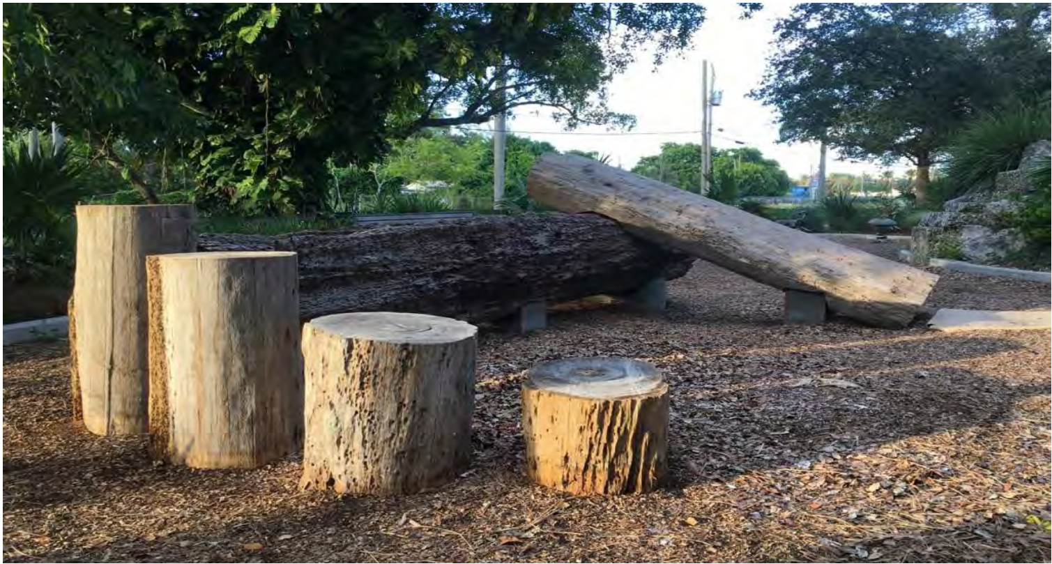
REFERENCE PARKS | Biscayne Shores and Gardens