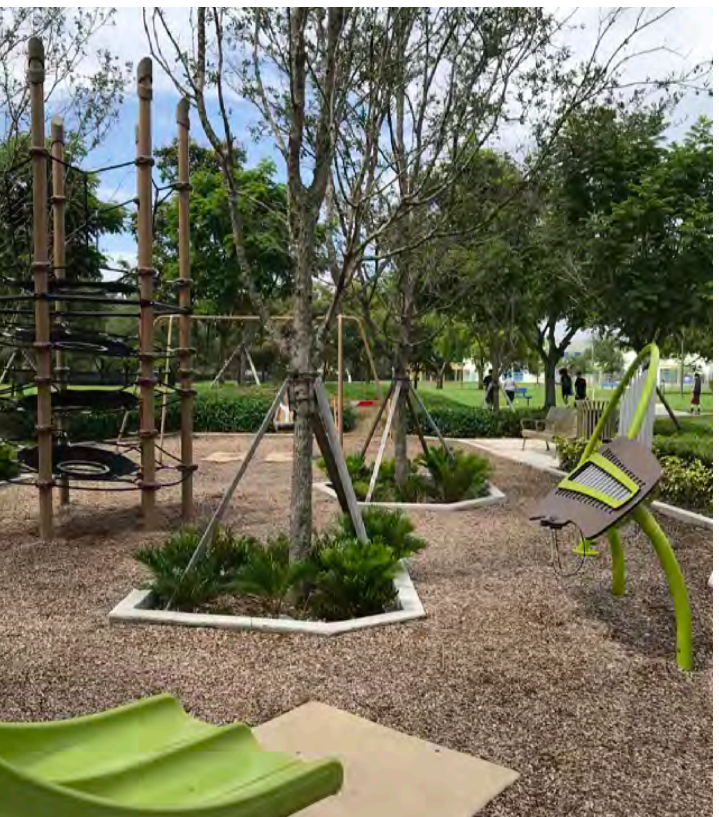
REFERENCE PARKS | Forest Lakes Park