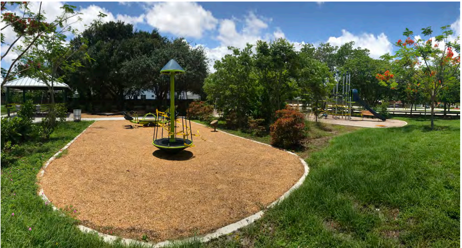
REFERENCE PARKS | Country Lake Park