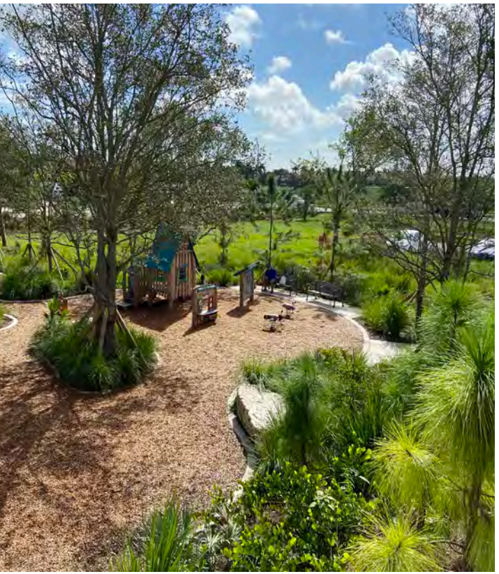
REFERENCE PARKS | Camp Matecumbe