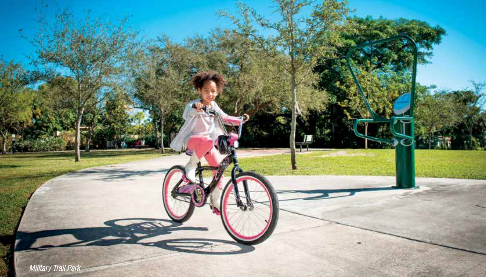
Military Trail Park

make a dream into a reality. Parks create a deep sense of community while protecting our natural environment,” Lorenzo declared.