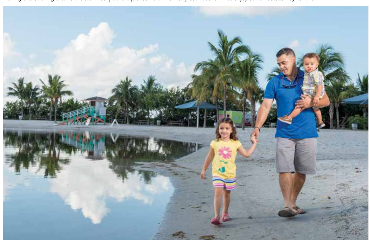
Fishing and strolling around the atoll tidal pool are just some of the many activities families enjoy at Homestead Bayfront Park.

According to Rolonda Breckenridge, longtime head lifeguard at Homestead Bayfront Park, "No matter what season it is, the water is always crystal-clear. Homestead Bayfront Park reminds me of a 'mini Florida Keys,' but with a much nicer and safer beach than you can find there, which is what attracts our patrons." Visitors range from German and French Canadian tourists to locals who prefer coming to the park over other South Florida beaches.