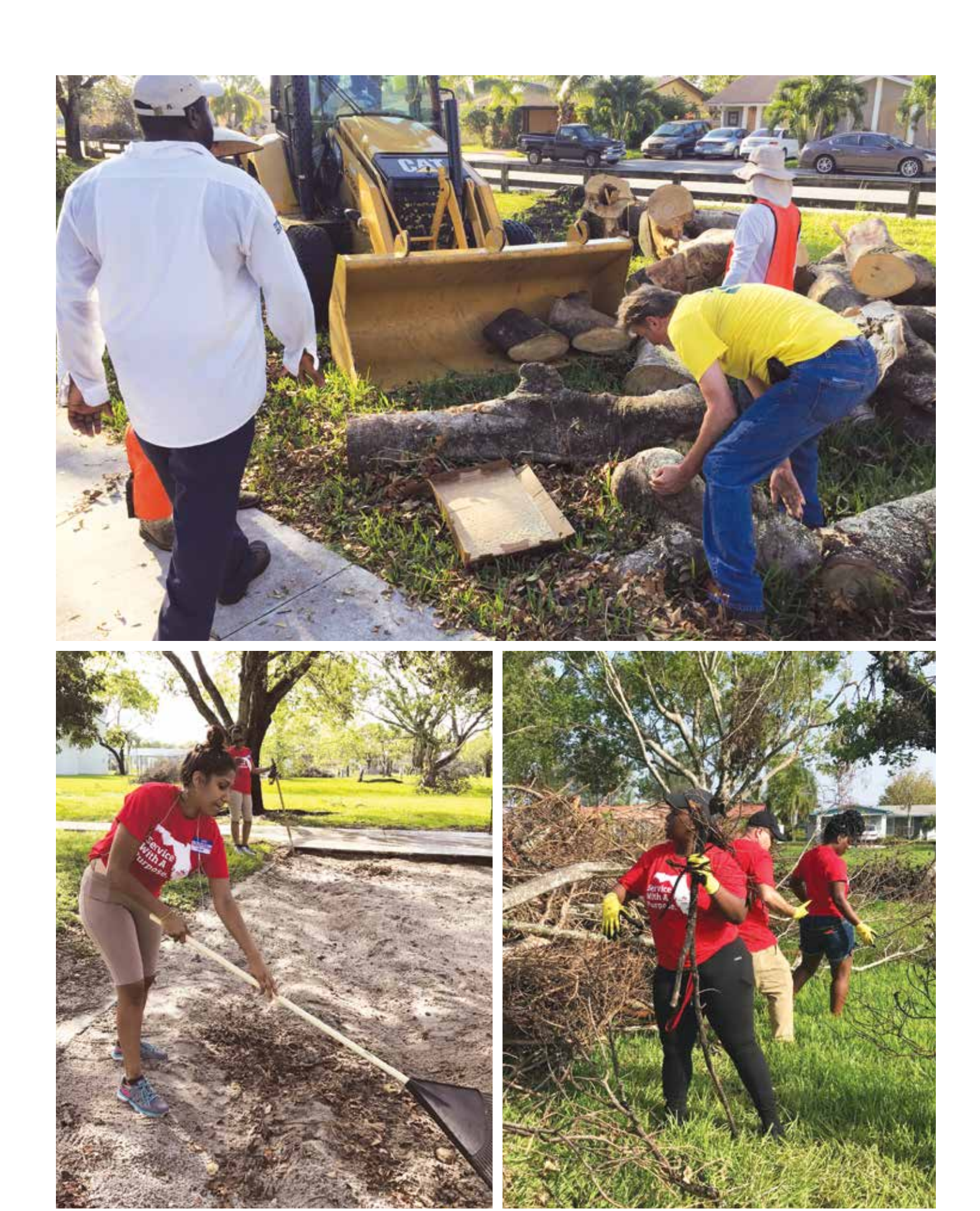
Parks staff and other volunteers worked hard to help clean up storm-ravaged areas.