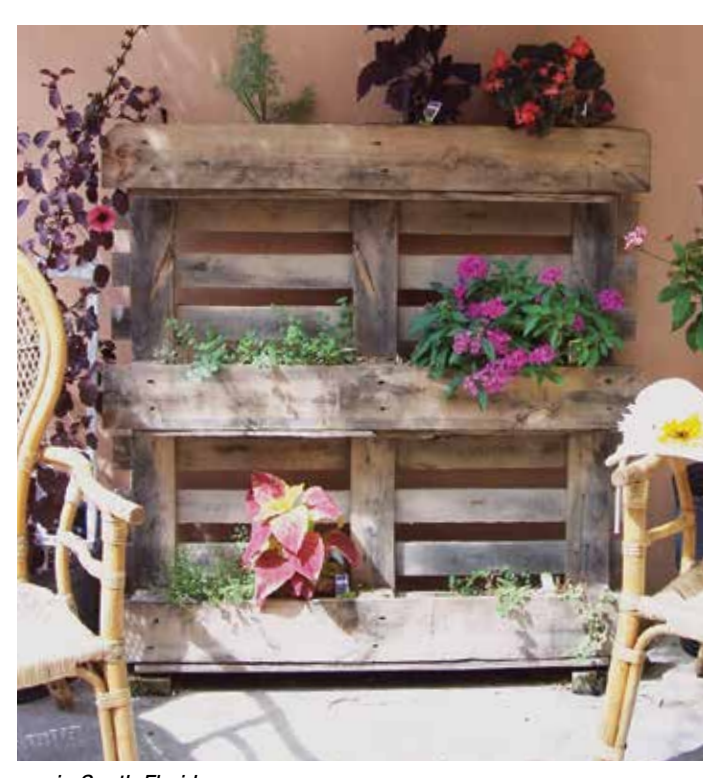
Because of our subtropical climate, many different edible plants can be grown in South Florida.

or South Florida gardeners, the end of summer signals the start of planning for a springtime harvest of fresh vegetables. If you have ever dreamed of growing your very own mixed salad, mid-October is a great time to start your vegetable and herb garden. While you can grow vegetables in the summer, it's best to stick with tropical vegetables, and of course you can garden year-round with tropical fruit.