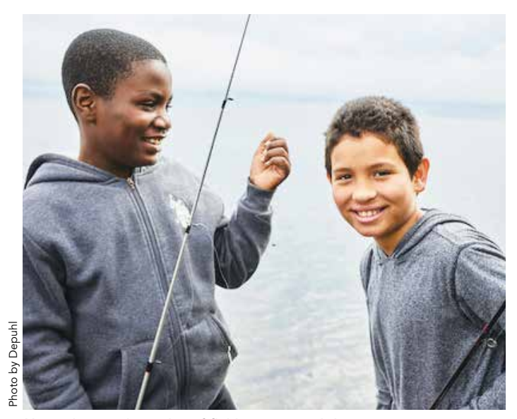
Young boys enjoy a day of fishing on a cool day.

Another shared partnership is the tour to Boca Chita Island on Miami-Dade Parks' Pelican Island Skipper. This popular tour is made possible thanks to a partnership with the City of Homestead, the National Parks Conservation Association, the Florida National Parks and Monuments Association, and the National Park Service. The family-friendly excursion departs from Biscayne National Park's Dante Fascell Visitor Center, located at Convoy Point, 9700 SW 328th Street. Departure times for the ADA-accessible Pelican Island Skipper are 10:30 a.m. and 1:45 p.m. Guests enjoy a guided 2.5-hour adven-