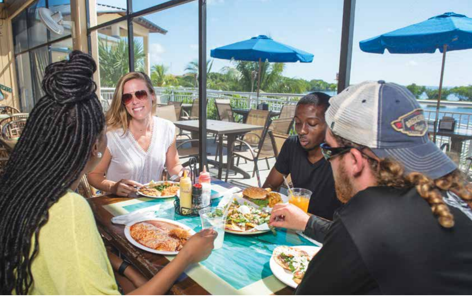
La Playa Grill's menu features delicious Mexican dishes, fresh seafood options and more.

can also rent bikes and ride on the trails within the park or enjoy the Biscayne Trail that runs just outside the entrance to Homestead Bayfront Park.