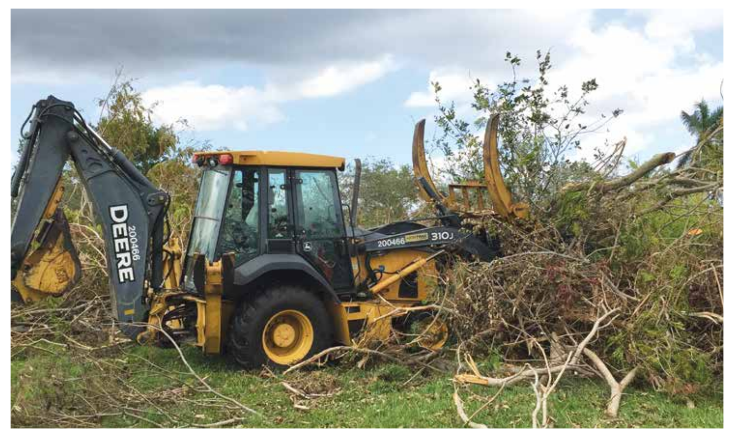
Downed trees could be seen all around the county's beautiful tree-lined neighborhoods.

damage Hurricane Harvey did, trees played an important role in absorbing and diverting water," says Lopez.