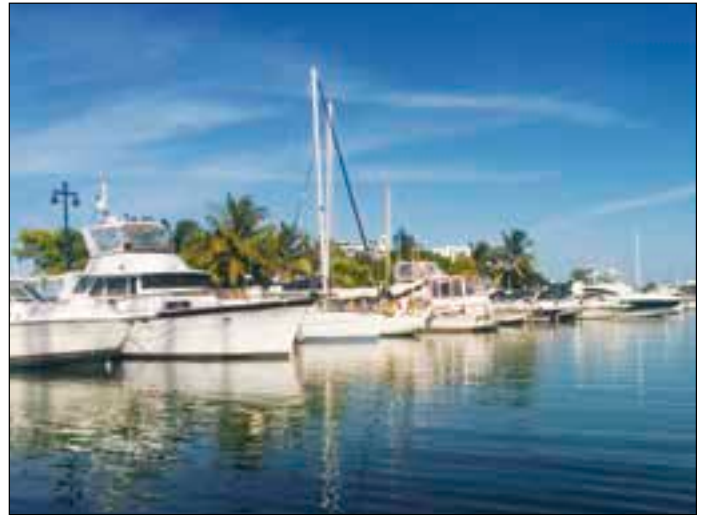
Pelican Harbor Marina

Experience a visitor-favorite—a two-hour guided sunset birdwatching trip each month aboard the Pelican Island Skipper (upcoming tours run Jan. 9 and Feb. 13). Tickets cost $40 per person which goes toward the seabird station's wildlife relief efforts. The cruise travels along the shores of the prominent bird rookery known as "Bird Key," home to brown pelicans, cormorants and other magnificent aquatic birds. Along with great birdwatching opportunities, there are amazing views