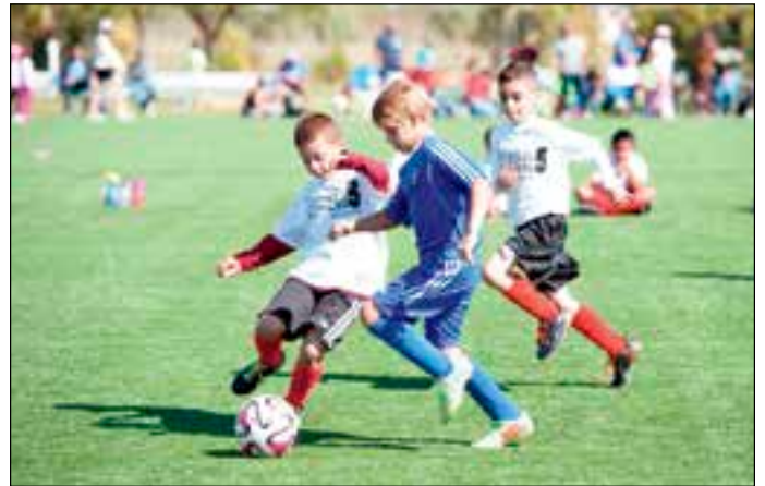
Teams compete at Amelia Earhart Soccer Complex.

"This premier soccer complex meets the gold-standard for public soccer facilities, accommodating everything from recreational pick-up games with friends to competitive club soccer activities and tournaments. It is going to keep this park in step with the needs of youth and adult