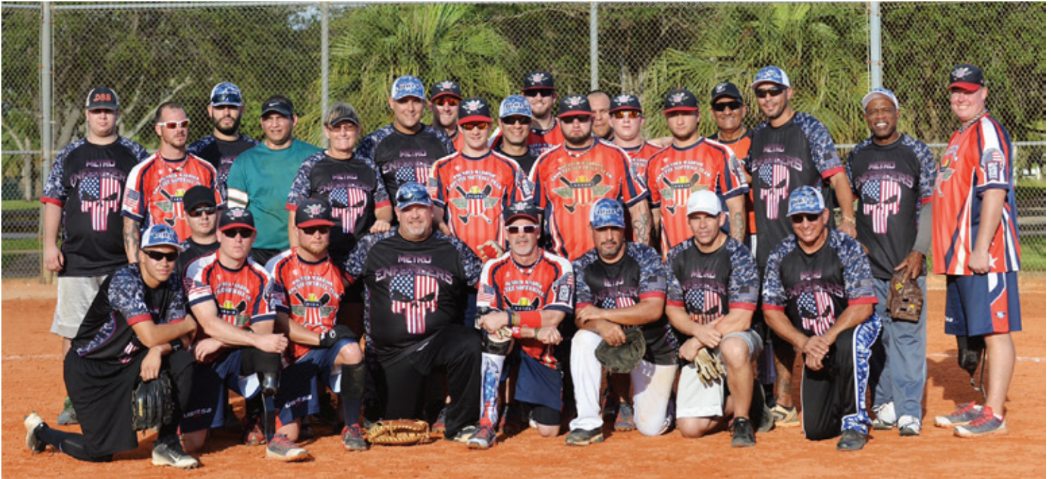
WWAST and Metro Enforcers.