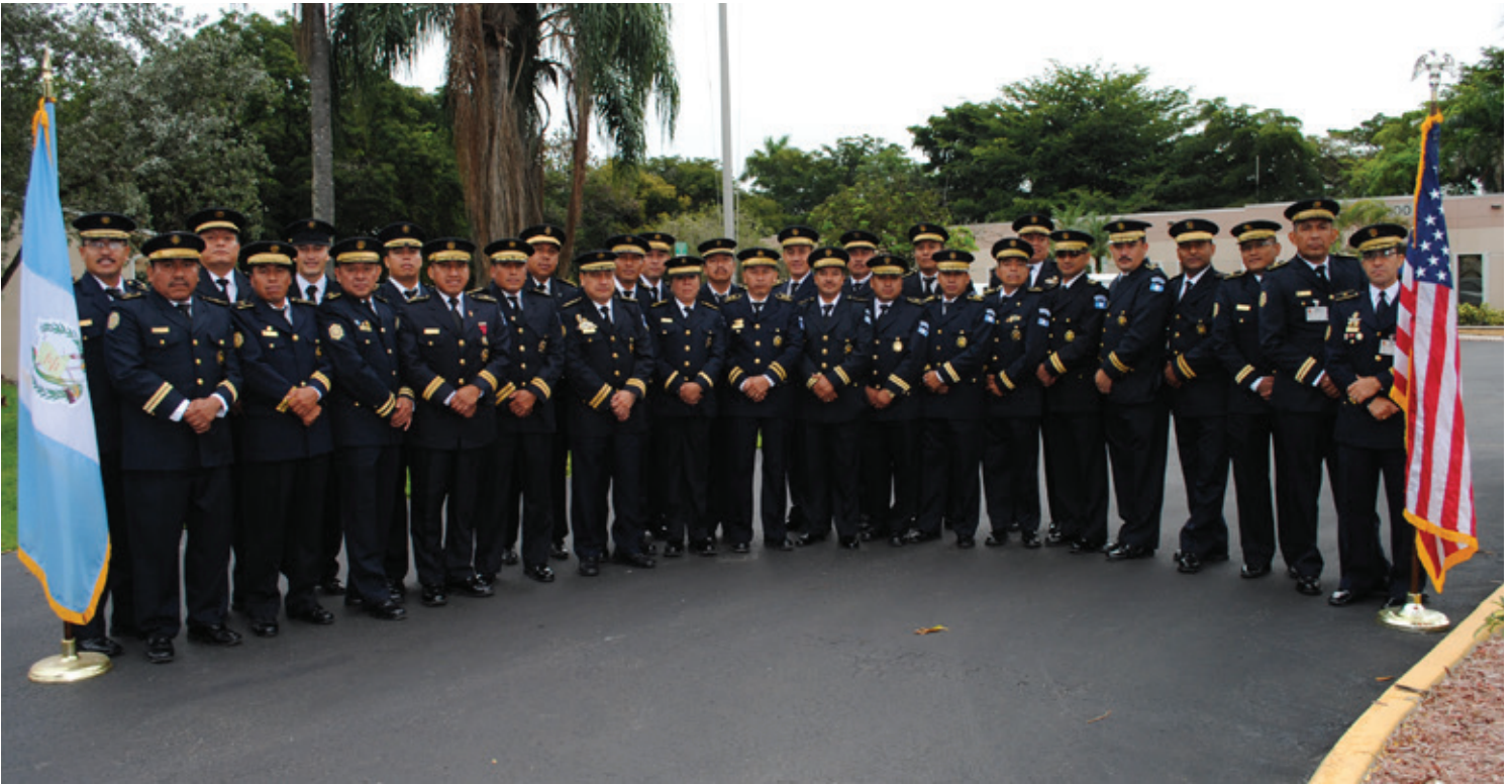
Officers of the National Police of Guatemala at their graduation from Miami-Dade Police Department training course on January 29, 2016.

MDPD Training Police Officers continued from page 2