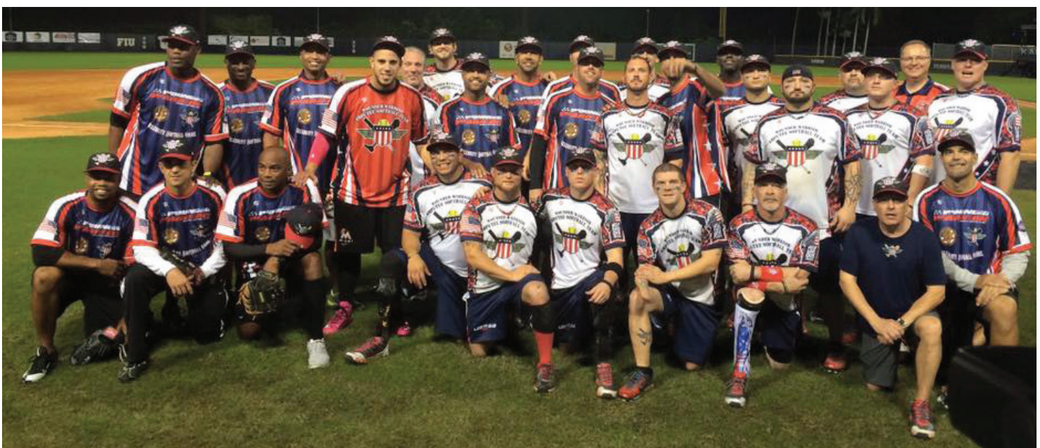
The WWAST played against a team of former Major League Baseball Players at FIU December 11, 2015.