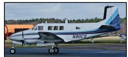
Beechcraft B65 Queen Air

POLICE CASE: PD120629247083 NIC # M014580304