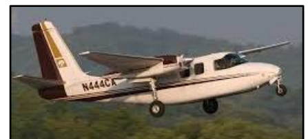
Aero Commander 560E

Use photos as a reference only. Not the actual aircrafts.