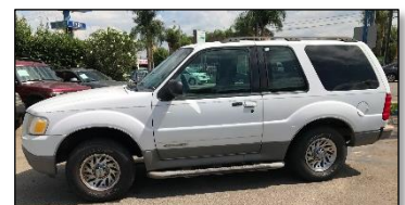
Use photo as reference only. Not the actual vehicle.