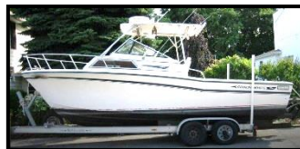
Similar vessel pictured

White, Male DOB: 11/27/1959 (60 years) 5'07", 170 lbs. Eyes: Brown Hair: Brown Clothing: Unknown clothing NIC: M093746772