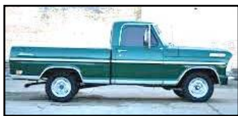
Use photo as reference only. Not the actual vehicle.