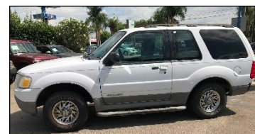
Use photo as reference only. Not the actual vehicle.