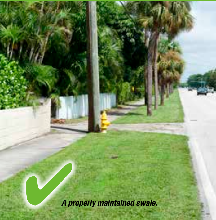
A properly maintained swale.

Learn why a well-kept swale is more important than you may realize