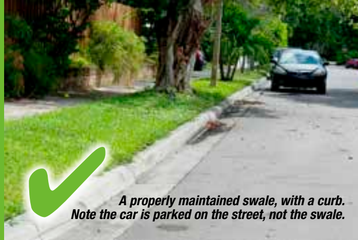
A properly maintained swale, with a curb. Note the car is parked on the street, not the swale.

Swales perform an important stormwater management function, but they differ from berms/barriers and ditches in that a swale slopes gently away from property and swales tend to be wider than they are deep.