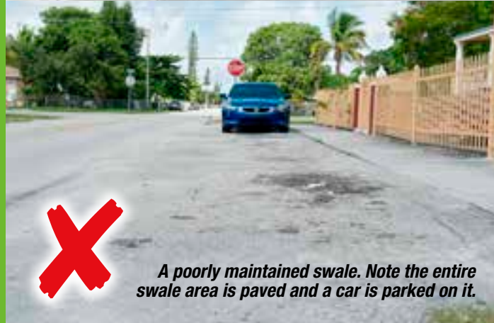
A poorly maintained swale. Note the entire swale area is paved and a car is parked on it.