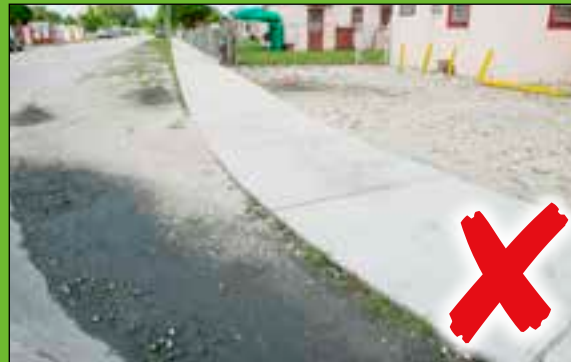
Note evidence of cars parking on the swale and the compacted soil.