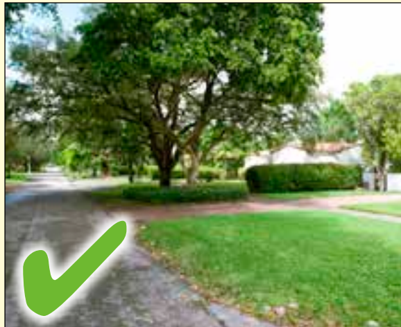
A properly maintained swale. Note that only the driveway approach is paved.