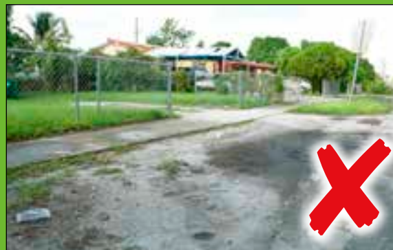
Note evidence of cars parking on the swale and the compacted soil.