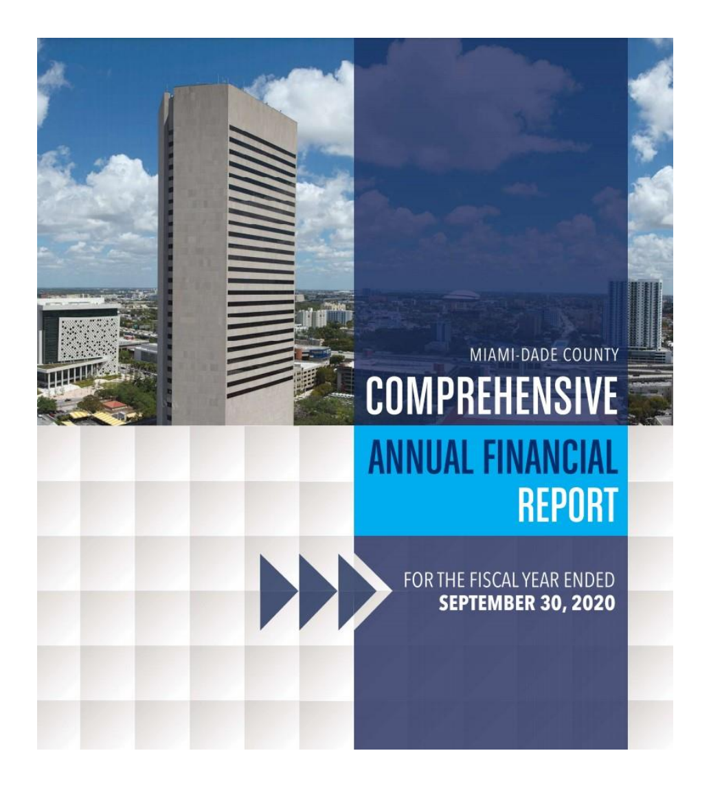
The Agency's 2020 Audit Financial Report can be viewed through the Miami-Dade County Comprehensive Annual Financial Report at the following link, by searching for "WPCRA," https://www.miamidade.gov/finance/library/CAFR2020-complete.pdf