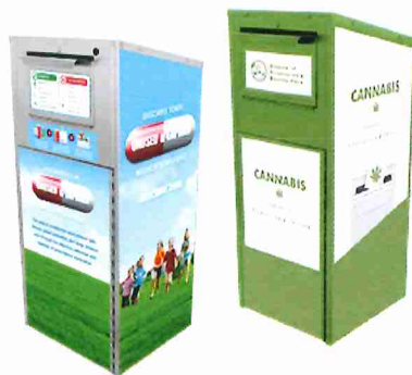
Drug & Amnesty Drops