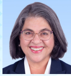
Daniella Levine Cava Mayor Miami-Dade County