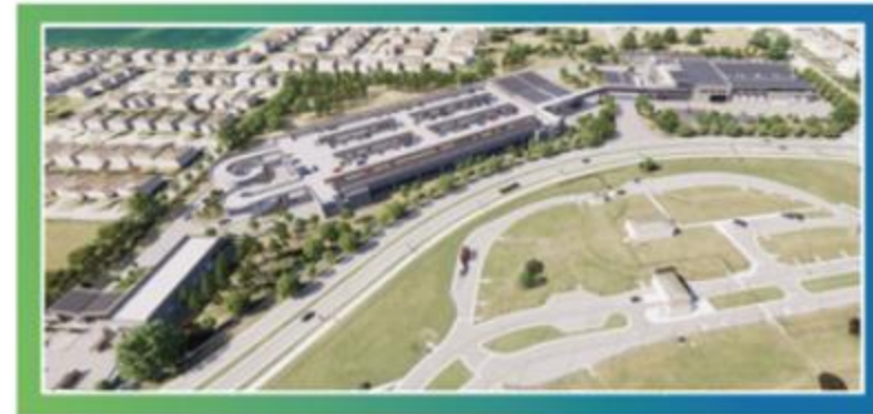
Transit Operations Center Rendering