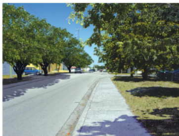
Above: Improvements in the public right-of-way with sidewalks and landscaping in the industrial district south of SW 184th Street.