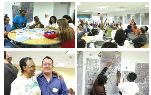
Top Left: Perrine Charrette Area Plan

The mission of the Perrine Design Charrette is to provide the entire Perrine Community a unified vision for the residential and commercial renaissance of Perrine. The vision aims to restore Perrine as a unique and flourishing destination with renewed economic and social viability. The Charrette Area Plan will prepare the area to receive future growth gracefully and creatively. The Charrette will build on past experiences, existing planning studies and the foundation provided by the 'Moss Plan' into a holistic strategy for implementation.