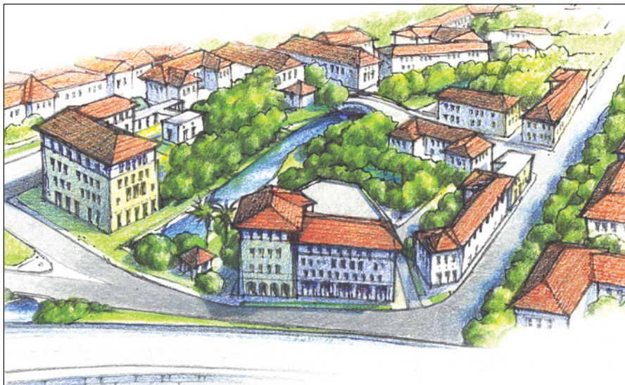
Turnpike Gateway: View to the east over the Turnpike between SW 184th and SW 186th Streets. During the charrette, citizens proposed hotel and tourism-related services in this area.