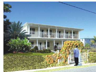
Above: An existing apartment building improved with new porches and additional landscaping.