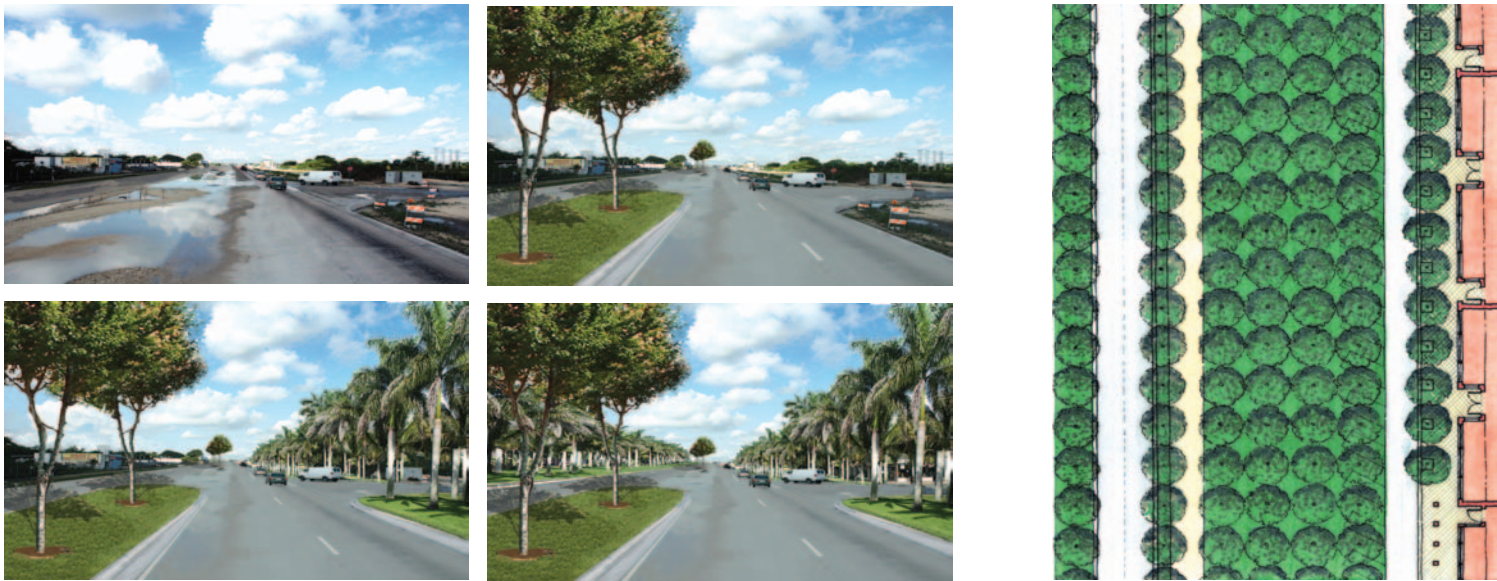
Above: Proposed phases of U.S. 1 improvement, clockwise from top left; current conditions; new median and landscaping; new curb and palm tree grove; final phase with grove on both sides of U.S. 1