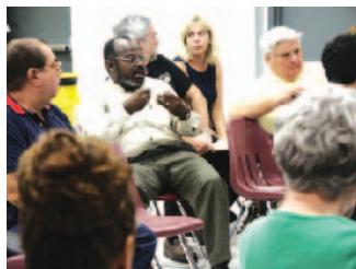
Below: Area residents participating during the charrette