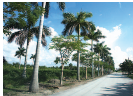
Above: Examples of Princeton's existing agricultural character