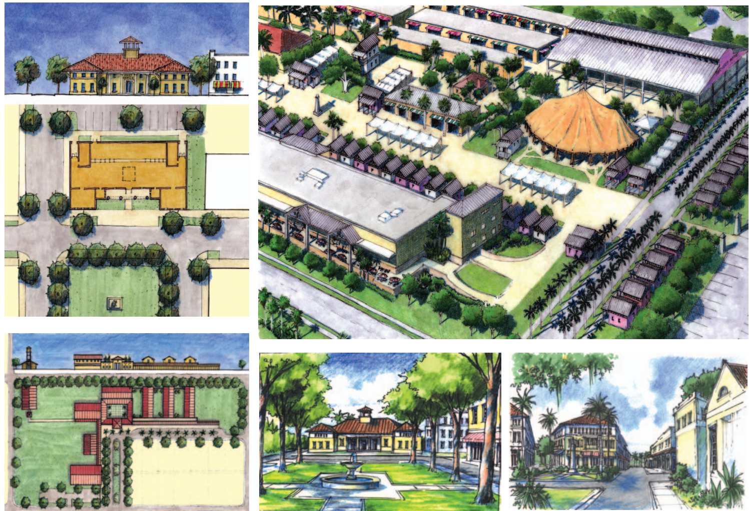
Top left: Proposed Post Office and public green Bottom left: Proposed school, plan and elevation