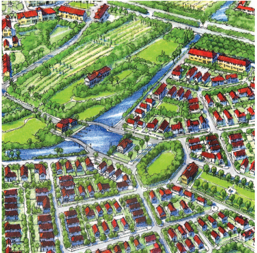
Above: View to the southwest over to the proposed greenway and boat launch on the C-102 Canal

A series of presentations by County staff will be conducted in the first half of 2004. This will be a time for citizens to provide further input and direction, and will represent the first step toward implementation of the Princeton CUC Charrette Area Plan.