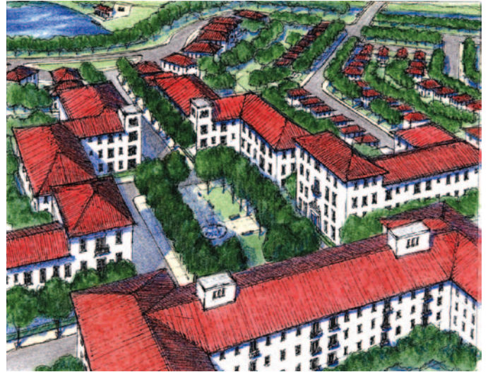
Above: Proposed Arts District between SW 240th and 244th Streets, view to the north, towards lake